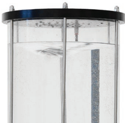
Initial water vortex during cavitation and vacuum application