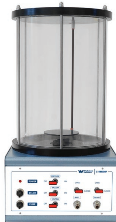
Standalone all-in-one de-airing system