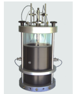
Universal Triaxial Cell