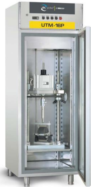
Upright servo-pneumatic Systems Environmental Chamber