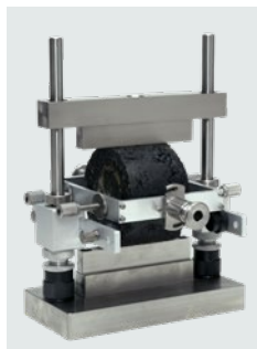
Indirect Tensile - Resilient Modulus Jig