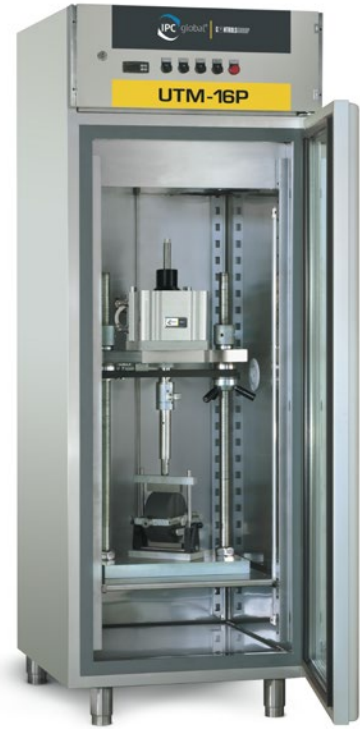
UTM-16P with Motorized Crosshead