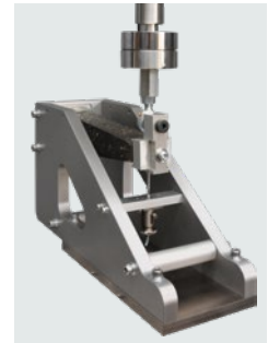
Trapezoidal Two Point Bend Jig