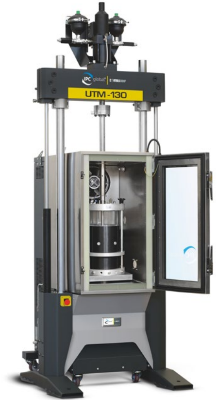
UTM-130 with Environmental Chamber