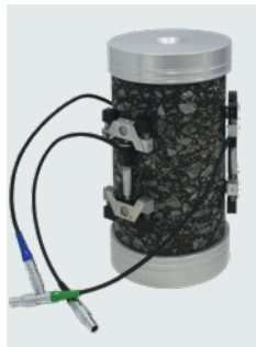
Dynamic Modulus E* Kit