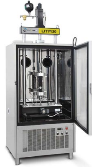
UTM-30 Environmental Chamber

*Dependant on thermal mass within chamber