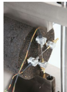
Indirect Tensile - Bi-axial Kit