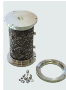
Uniaxial Fatigue Kit