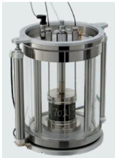
Automatic Triaxial Cell