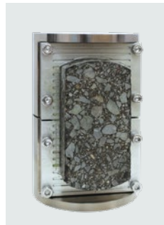
Overlay Test Jig