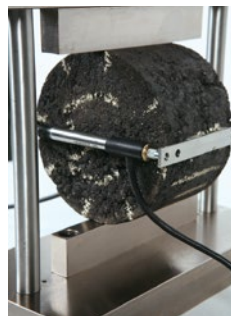
Indirect Tensile - Fatigue Kit