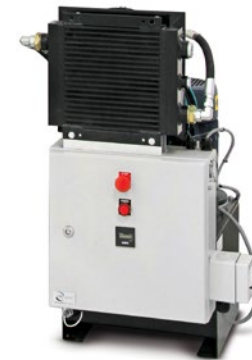
Hydraulic Power Supply