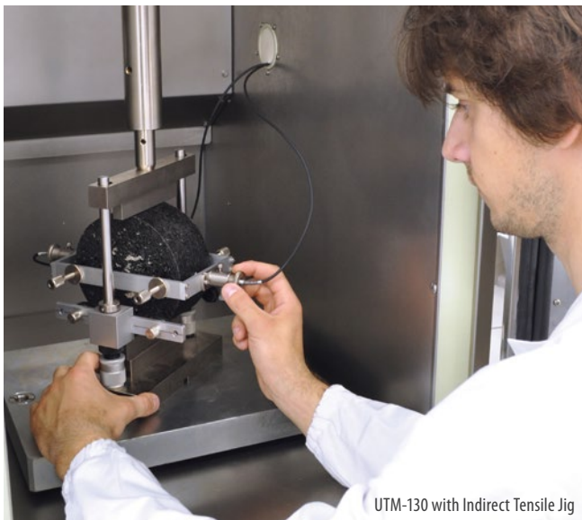
UTM-130 with Indirect Tensile Jig