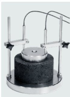
Permanent Deformation/ Dynamic Creep Jig