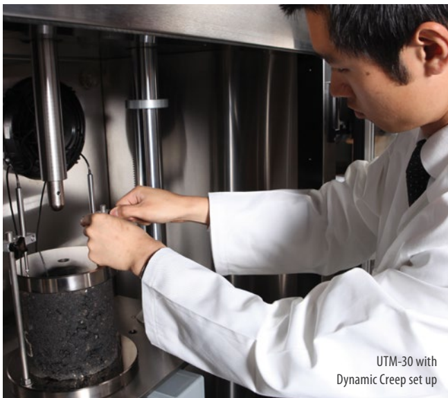
UTM-30 with Dynamic Creep set up