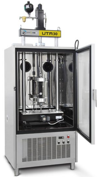
UTM-30 with Environmental Chamber