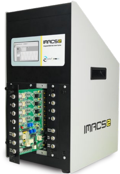
IMACS2 integrated into our UTM Systems