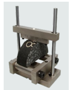
Semi Circular Bend (SCB) Kit