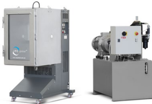
UTM-130 Environmental Chamber

High accuracy and total control over temperature ramps and dwells are achieved using the Programmable Digital Controller enabling users to easily perform complex tests e.g. TSRST and UTSST.