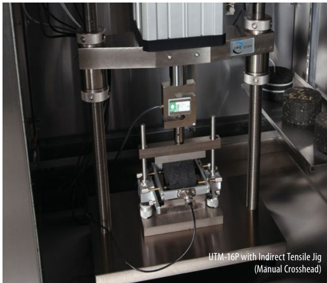
UTM-16P with Indirect Tensile Jig (Manual Crosshead)