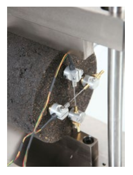
Indirect Tensile -Bi-axial Kit