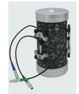
Dynamic Modulus E* Kit