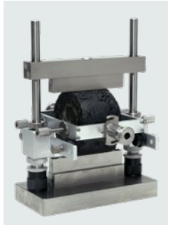
Indirect Tensile - Resilient Modulus Jig