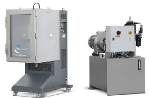
UTM-130 Environmental Chamber Hydraulic Power Supply

High accuracy and total control over temperature ramps and dwells are achieved using the Programmable Digital Controller enabling users t easily perform complex tests e.g. TSRST and UTSST.