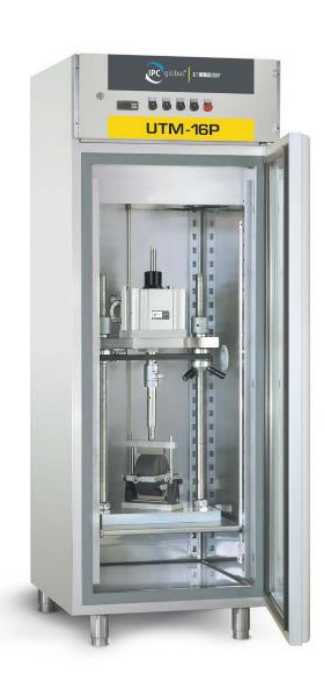
Upright servo-pneumatic Systems Environmental Chamber