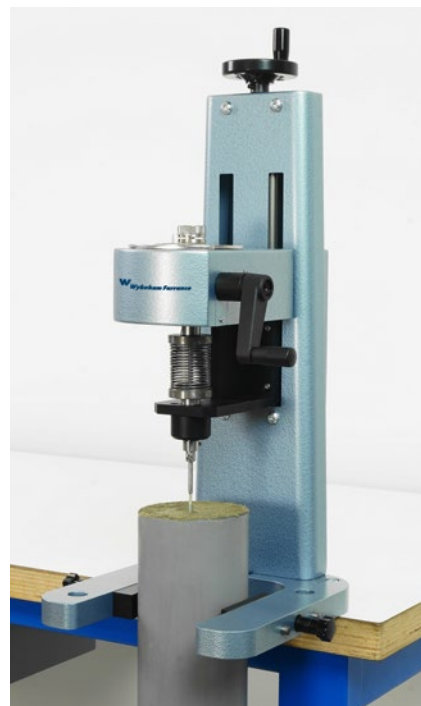
Vane Apparatus (27-WF17D30) fitted with holding sampling tube (27-WF1738) and 100 mm sampling tube.