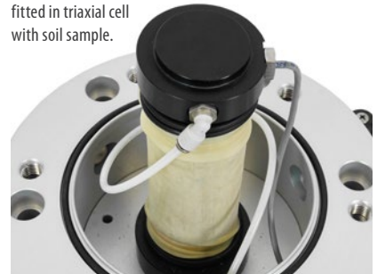
Pedestal and top cap fitted in triaxial cell with soil sample.

Additional optional bender elements configurations are available depending on users' requirements: