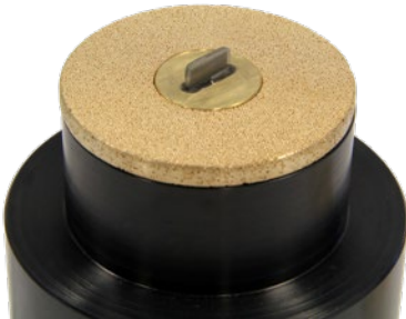
Bender element with sintered bronze stone

The complete STANDARD configuration suitable for Triaxial System includes: